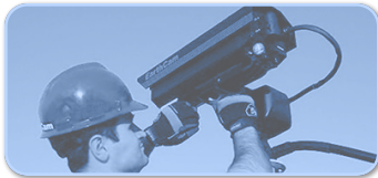
Installation and Maintenance