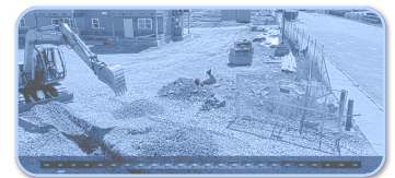
Continuous Video Recording