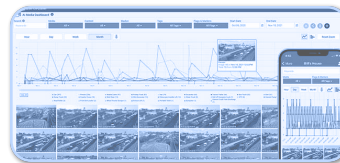
AI Media Dashboard