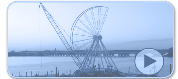
AI-Edited Time-Lapse Videos