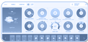
Current and Historical Weather Data