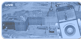
iOS and Android App