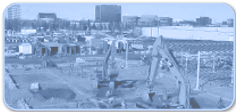
Live Streaming Video

Specification includes camera system and managed services