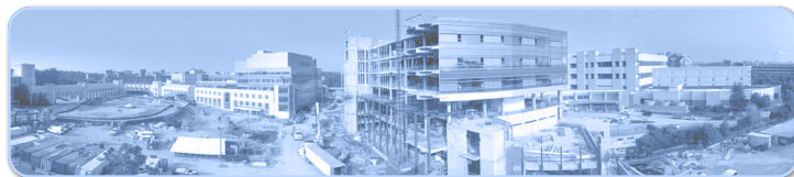
Auto-generated Megapixel Panoramas