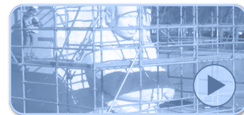
AI-Edited Time-Lapse Videos