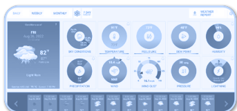
Current and Historical Weather Data