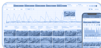
AI Media Dashboard