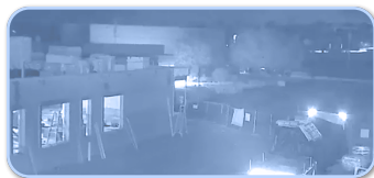
Automatic Day/Night IR mode