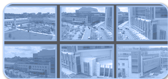
Multiple Preset Archiving