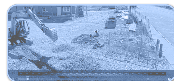
Continuous Video Recording