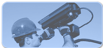
Installation and Maintenance