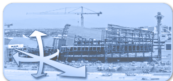
Live Streaming Video

Specification includes camera system and managed services