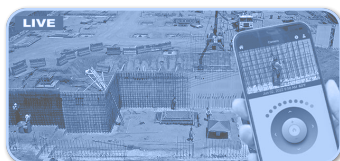
iOS and Android App