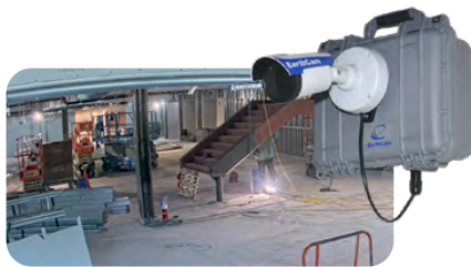
Mobile StreamCam 4K All-in-one portable 4K video solution

Specify this pan-tilt-zoom camera where ultra-wide area coverage with live streaming video and continuous video recording is required. Ideal for interior projects or as part of a multi-camera documentation package.