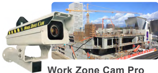
Work Zone Cam Pro Fixed-position time-lapse camera

Specify this fixed position camera for interior projects where you can view the entire jobsite from the camera mounting location, or as part of a multi-camera documentation package.